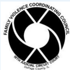
Family Violence Coordinating Council | DuPage Courts